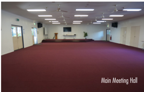
Main Meeting Hall